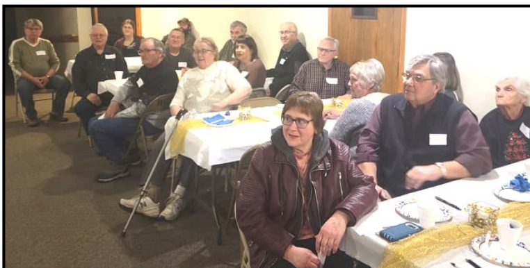
Riverside-on-the-Road in Bark River, MI in January 2022

Riverside-on-the-Road, the name for the regional get-togethers, met in the Chicago area in March and will be in Minnesota in April. Check the website tab “RBC Connections” for more information and to keep abreast of new events. If you would like a meeting in your area, or if you have any questions about membership, please contact connections@riversidebiblecamp.org .