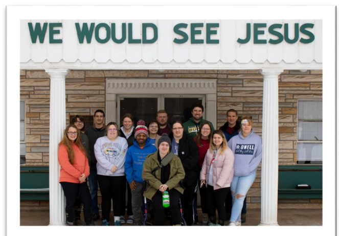
Elevate attendees in January 2022

Our generous donors have the option to designate special gifts directly to our various programs. Would you prayerfully consider supporting our LIFT program? You can help young adults spend part of their summer serving here in full-time ministry. Simply write "LIFT" in the memo line of your gift and you will be helping a mission-minded young adult be a part of our incredible ministry here at Riverside for the months of June and July.