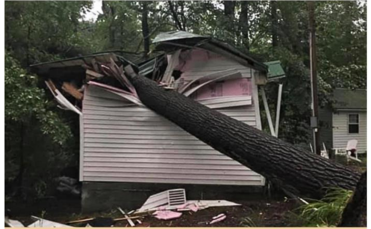
Original Zarephath, destroyed in 2019

More exciting projects are on the horizon as Riverside seeks to better-serve its growing community. ■