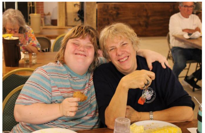
Top: Wagon ride through the woods and to River Hills Farm during the RBCC Weekend Retreat Bottom: Attendees enjoying a meal together at RBCC Weekend Retreat in September